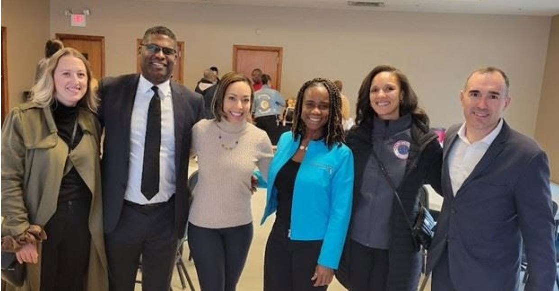
Breakfast at Horatio Williams Foundation